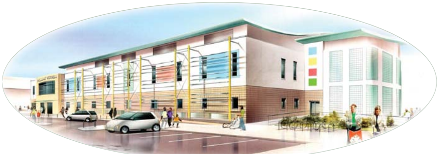
New Mount Vernon Treatment Centre: December 2008

Such fantastic services literally at the doorstep of our new surgery will be of immense benefit to the patients of the Steven Shackman Practice and will also help towards protecting the Mount Vernon site in order for it to remain a place providing excellent health care for patients.